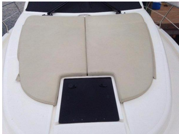
Bow Sun Pad