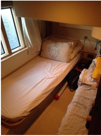
Guest Starboard Side