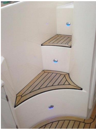
Blue Courtesy Lights