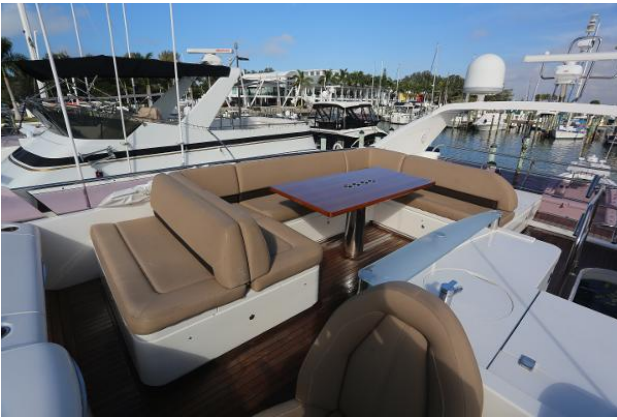
U-Shaped Flybridge Seating