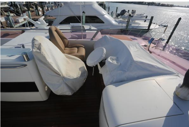
Flybridge Helm Covers