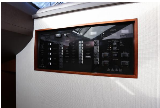
AC/DC Distribution Panel