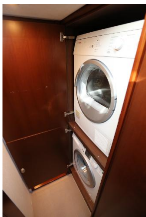
Washer/Dryer in Companionway