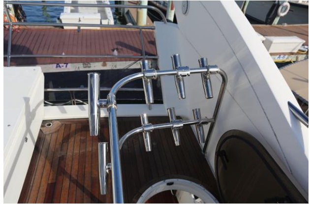
Flybridge Fishing Rod Storage