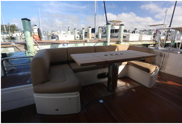
Cockpit Lounge Seating & Table