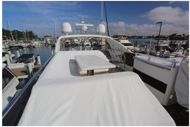
Flybridge Seating with Covers