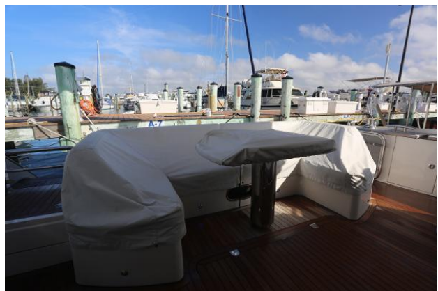
Cockpit Lounge Seating with Covers