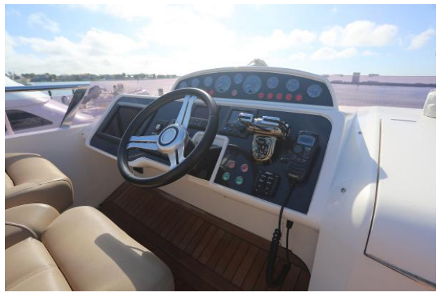
Flybridge Helm & Electronics