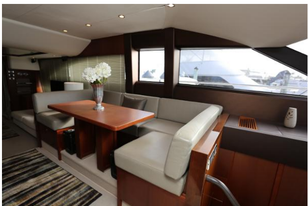
Dinette to Port