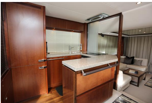
Galley with Glass Partition Open