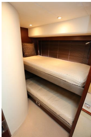
Port Guest Bunk Stateroom