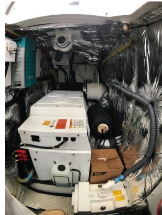
Generator in Aft Machinery Space