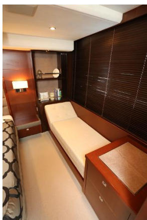
Settee to Port in Master Stateroom