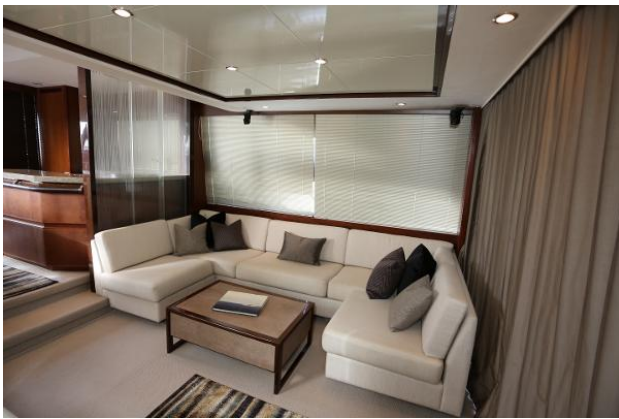
U-Shaped Lounge Seating to Starboard