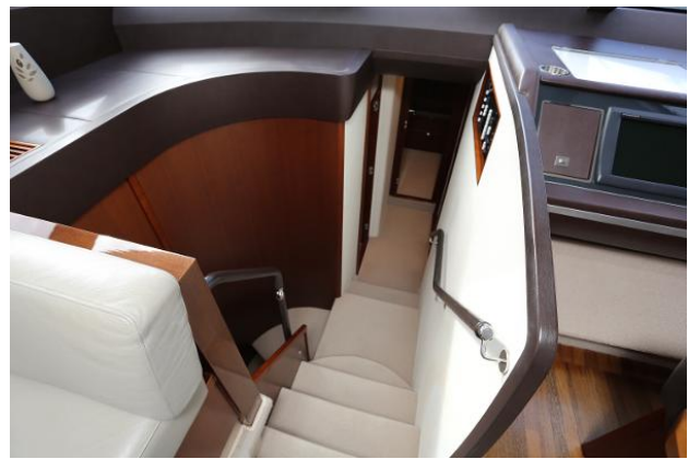
Companionway to Lower Deck