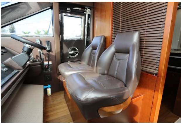
Lower Helm Seating for Two