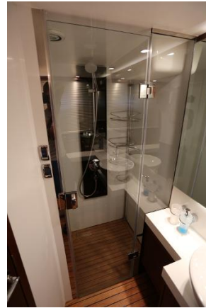
Master Stall Shower