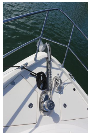
Windlass on Bow