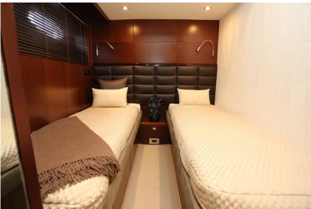
Starboard Guest Stateroom