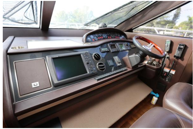
Helm & Electronics