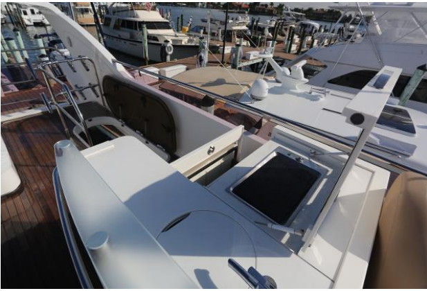
Flybridge Wet Bar with Sink, Grill, and Fridge