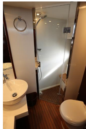
Forward VIP Head