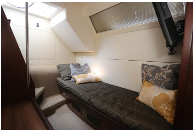
Crew Quarter Berths