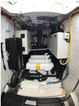
Aft Machinery Space