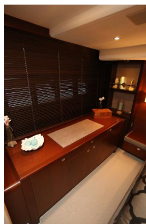
Vanity to Starboard in Master Stateroom