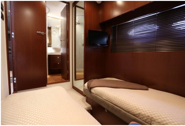
Starboard Guest Stateroom