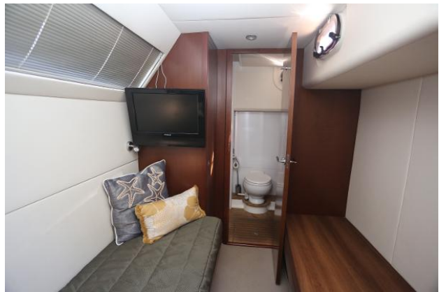
Crew Quarters & Head