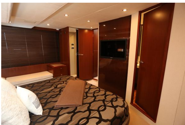
Master Stateroom TV