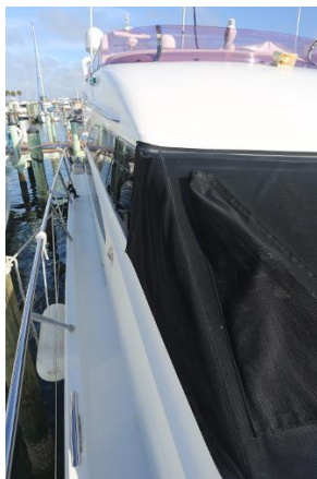
Wraparound Windshield Cover