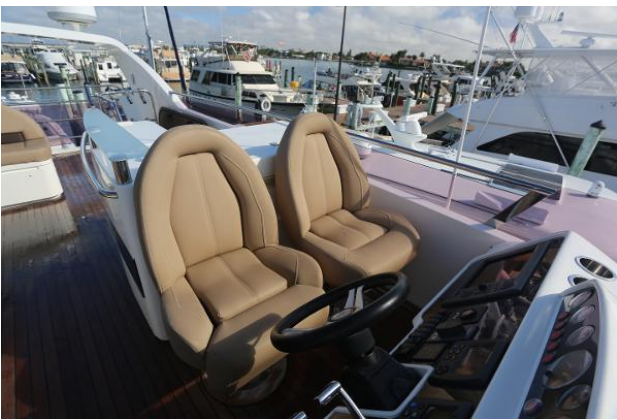
Flybridge Helm Seating