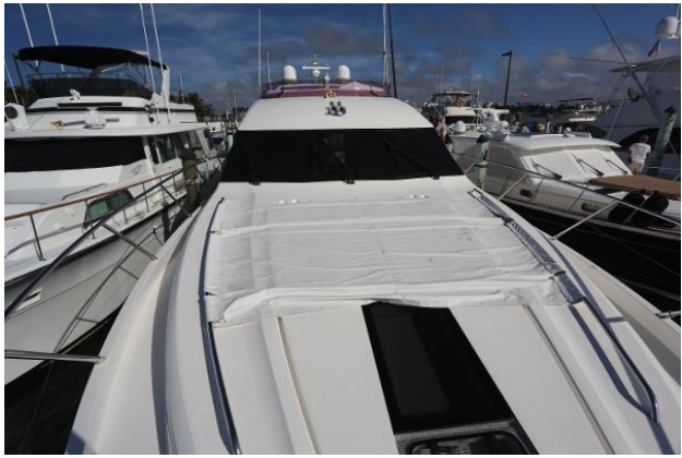
Foredeck Sunpad with Covers