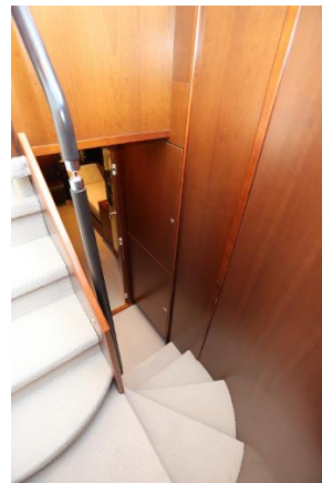
Companionway to Master Stateroom