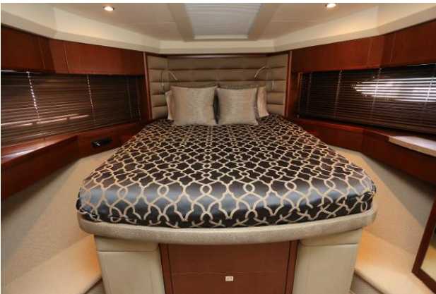
Forward VIP Stateroom