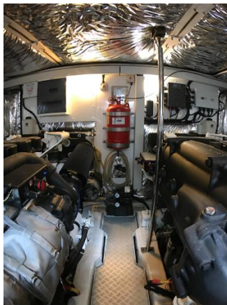
Engine Room Facing Forward