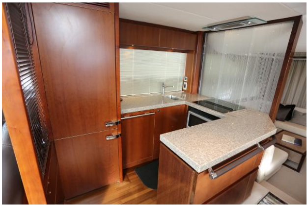
Galley with Glass Partition Closed